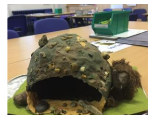
Right: Year 3 Stone Age Cave made for homework.

Please come along and share your positive experiences and offer your thoughts on how we can make our homework even better.