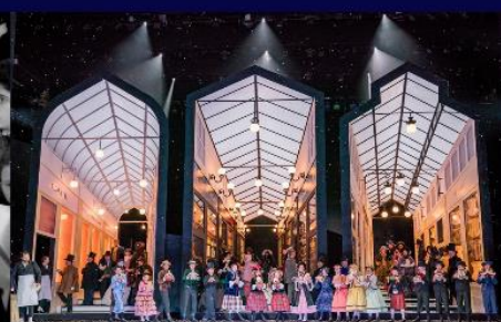
La Boheme at the Royal Opera House