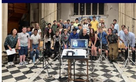
Recording with Joe Hisaishi

Junior Choir (Y3-6): Mondays 4.15-5pm ~ Senior Choir (Y7-13): Monday 5-6pm ~ Tiffin School Music Department