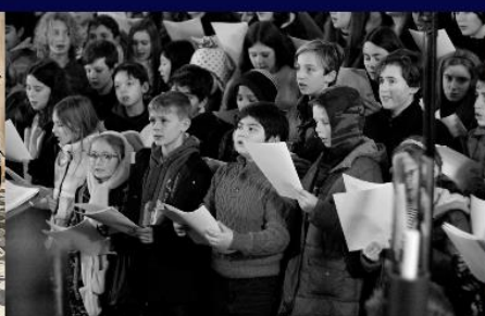
Making "A Tiffin Christmas" CD