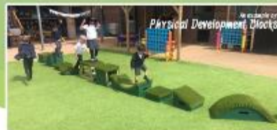
Physical Development Blocks