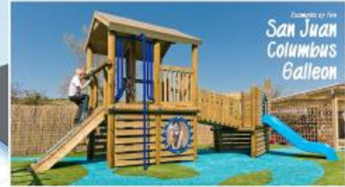
San Juan Columbus Galleon

Total Decking Surfacing Perimeter = 110.6m Area = 510.4sqm Including 107.0sqm of Blue River Thone and 38m² of Light Green Duratone + 137.2m² of Drapery 18.2m of Monkey Perching Including 1 x Gate