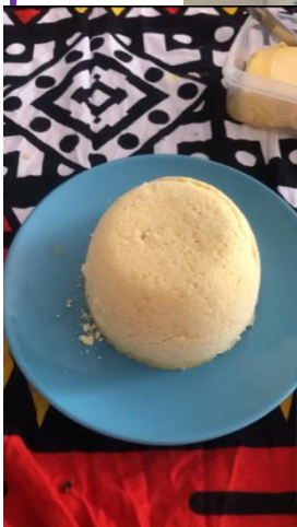
Traditional Cape Verde cake called 'cuzcuz'