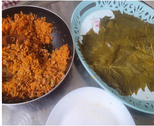
Food Fabulous Food!