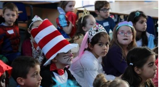
And of course the staff joined in, too!