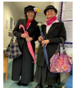
King Athelstan Primary School - Inspiring Excellence