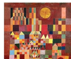
Nursery - Klee Class

We offer 15 hours entitlement, timings above. Nursery admissions are organised directly