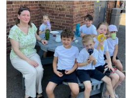
Al fresco Breakfast Club!