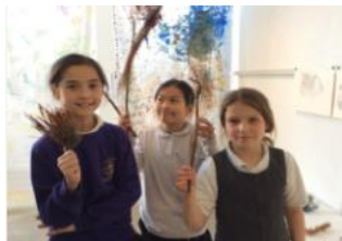
Stanley Picker Art Club

This week has been an exciting time in Art. One of our Y6 artists scooped first prize (age 8-13) in the Rotary Art Club Competition (see below). The standard of work from all the entries was amazing.