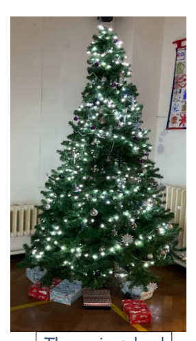
The main school tree in the Hall

In my KS2 assembly this week, we talked about the importance of using kind words. We listened to a story about someone who realised they could not take their unkind words back once they had been said, and the impact this had.