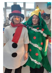
Wilson Jones lunch staff!

PE days will change for some from January 2025. Both Y5 classes will be going swimming on Fridays - see the letter for details. The new timetable has been issued today, and is also on the website under 'For Parents and Carers' so please check your child's class.