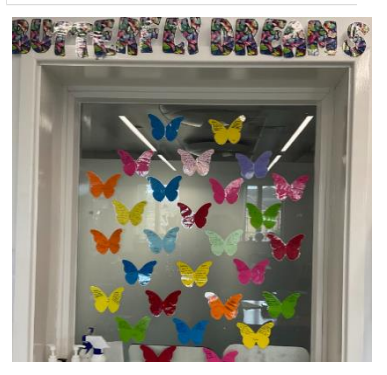
Donations to School